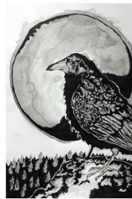
Drawing Native Songbird by Conner Harris Corvallis High School

The entries last year focused on the natural beauty found in the Bitterroot; this includes unaltered land, geographical features, local plants and wildlife, and nature preserves. The winning school from last year with the most top-10 entries was Florence-Carlton High School. Last year's first-place entries pictured below: